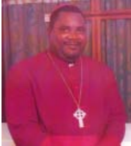
The Bishop's Message April 2007